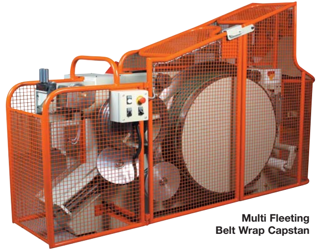
Multi Fleeting Belt Wrap Capstan