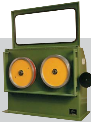
Twin Wheel Capstan