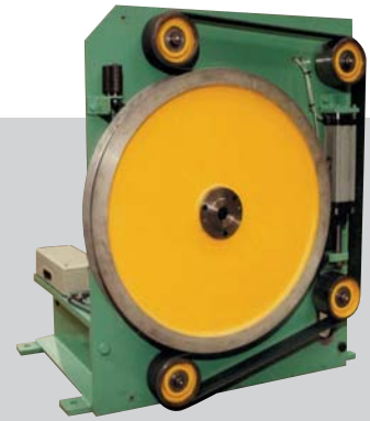
Vertical Belt Capstan