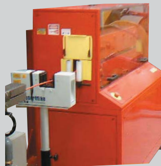
Pipe Parallel Caterpillar